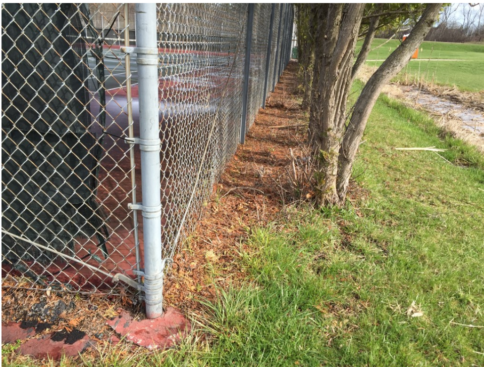
Photo 8 - Southeast Corner Looking North